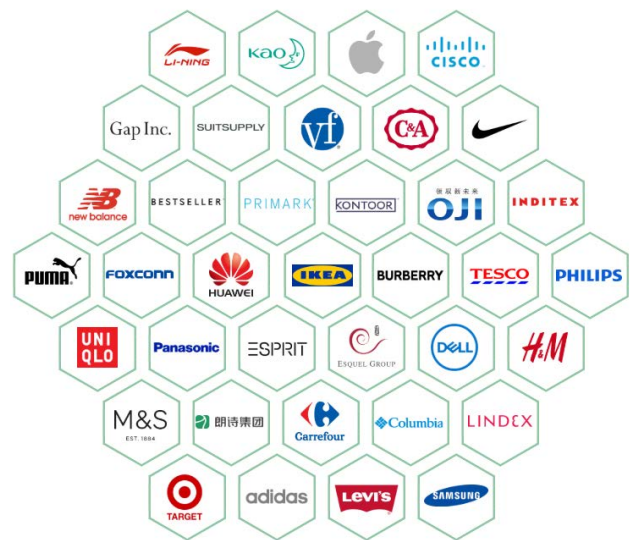
Brands Participating in Blue EcoChain 2019

First launched in 2018, Blue EcoChain is proving to be an extremely potent tool to assist in lowering China's pollution problems; over 40 participating brands and 50 domestic manufacturing participants have registered more than 10,000 suppliers into the automated system. Blue EcoChain now drives the majority of the 100-150 factories contacting IPE every week to publish explanations and rectification plans for their compliance problems.